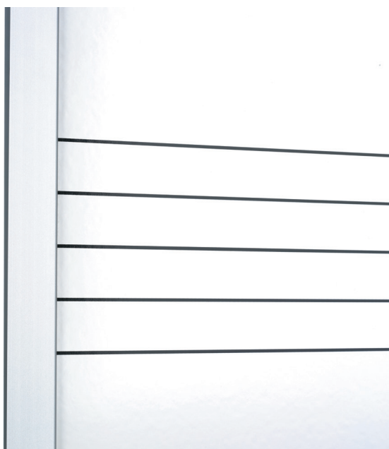
Music Staff Lines